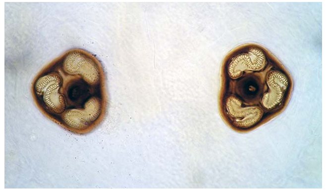
Stomoxys larval spiracles