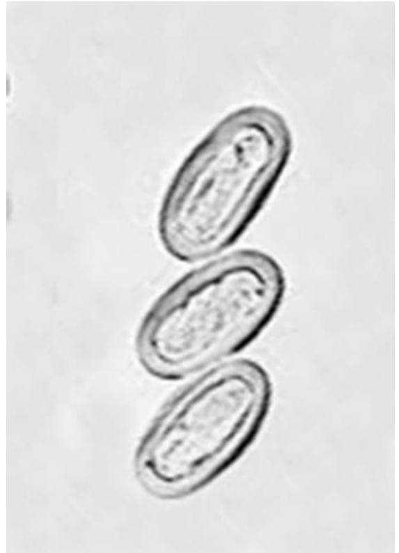
Cylicospirura worm eggs